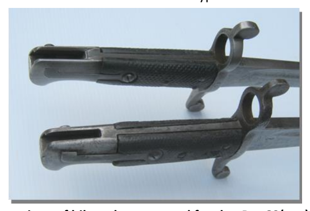
Comparison of hilt and cross-guard for the Pat 60(top) bar on barrel and Pat 58 (bottom) bar on band.)

These bayonets were also used for the carbines and short rifles converted to Snider breech loading system and new made MK III Snider Artillery carbines. Many were later bushed for the Martini Henry Rifle (see NZAR 135). Volunteer versions of these bayonets were also made by private contractors.